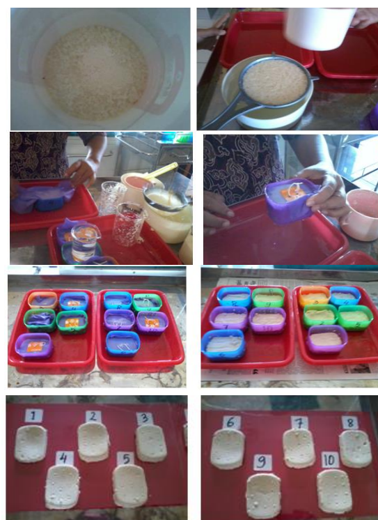
Figure 2. Processing of synbiotic tofu on laboratory scale.