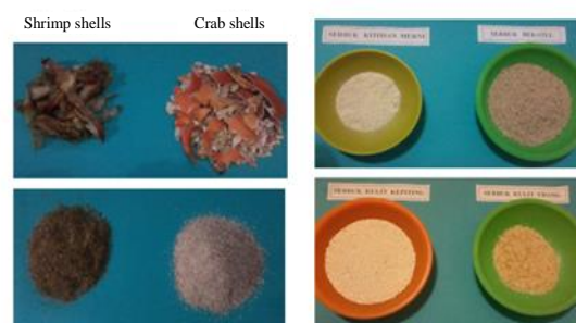
Figure 1. Synthesis of chitosan.

lowering the pH of the solution, 3) pressing to separate and condense the protein from the whey. The process of submersion soybeans soaked in water for 8-12 hours, it makes soybeans will absorb water until it reaches a saturation limit and yield of soybean become soft thus simplifying the process of milling. Besides submersion, it can provide better dispersion the extraction of soybean, as well as reducing the typical odor of soybean [9], [10]. Milling aiming for soy protein extraction easier and the addition of water as much as 8-10 times the amount of processed soy. Soy milk extraction process is affected by temperature, extraction can be done with cold water or hot water (80-100°C). During the extraction, the higher temperature and speed are results the greater the amount of material extracted. Therefore, the processing tofu, the material is extracted proteins that cause warming and denatured proteins are difficult to dissolve in water. Chito-oligosaccharides from fishery waste as a source of prebiotics. Additionally biopreparation synbiotic in yogurt provide a synergistic effect as lowering cholesterol levels in vitro and in vivo [11].